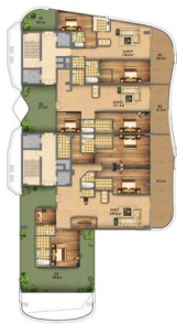
14th TO 18th FLOOR