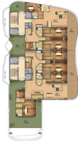
19th TO 20th FLOOR